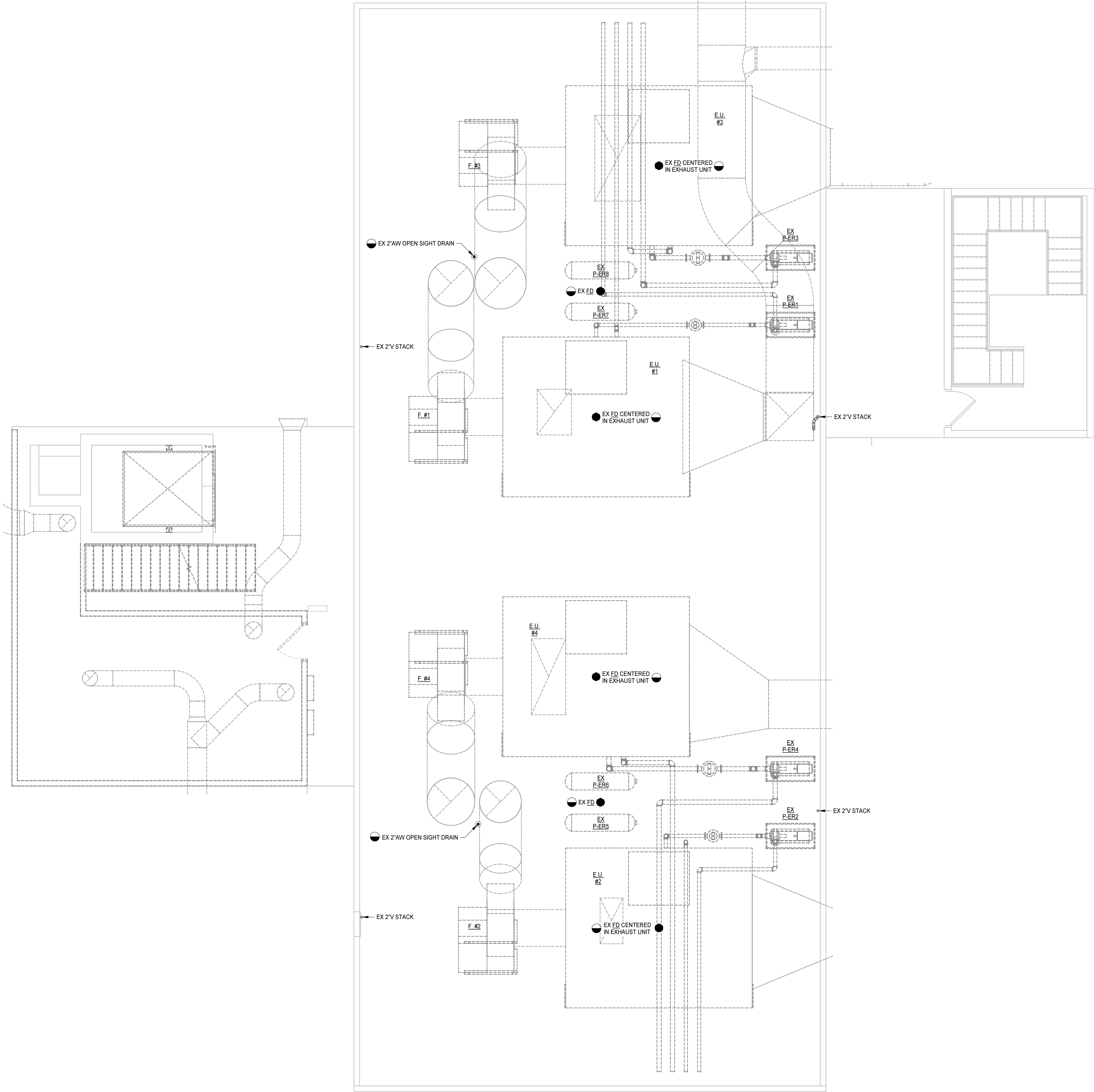
ATTIC FLOOR PLAN - DEMOLITION 1/4" = 1'-0"